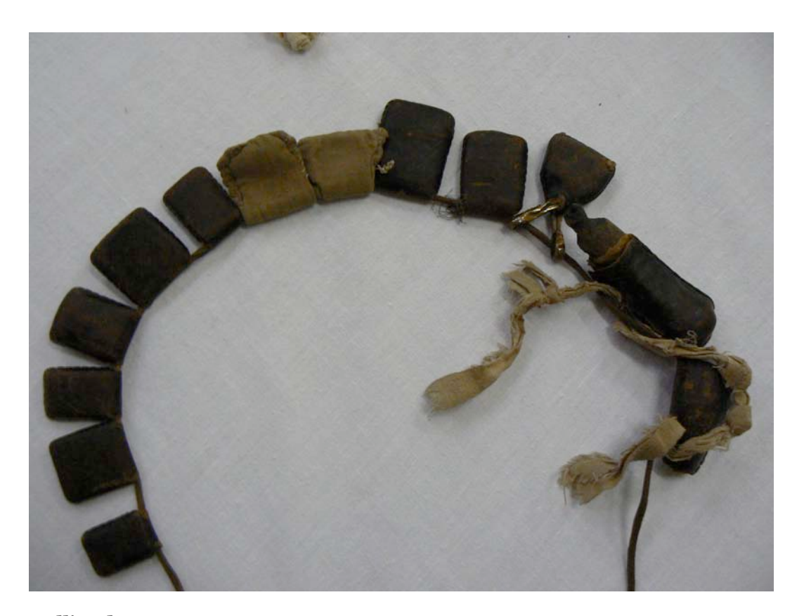
Collier de GRIS-GRIS