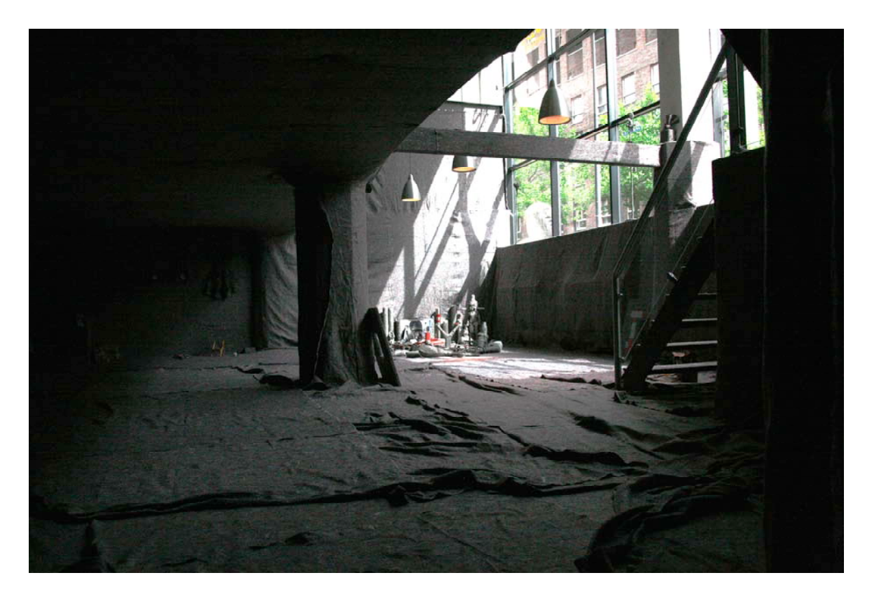
Overview of the installation