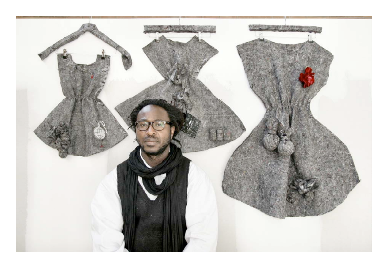
The Artist posing with the Matrouschkas