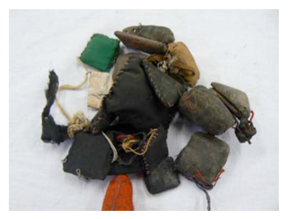
GRIS-GRIS DE TETE. Are mostly wore by women on their head under the head scarf