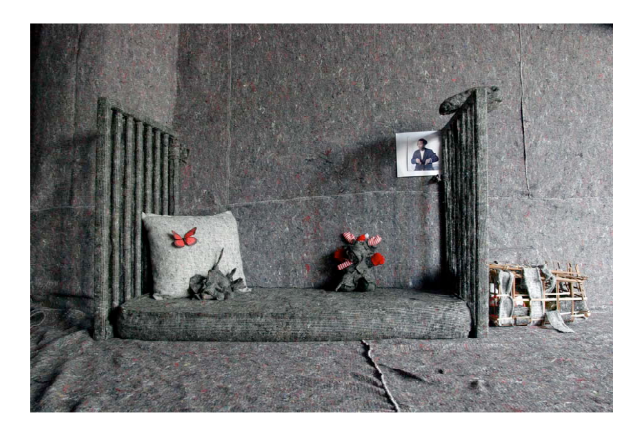
Details from the installation (daughter's Nursery)