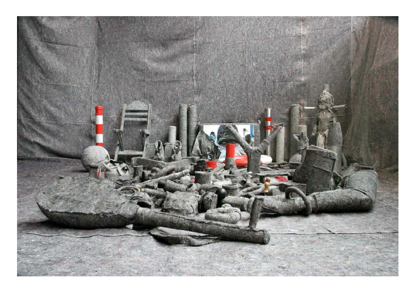
Load & Unloading (lost & found items) 2009 overview of installationn