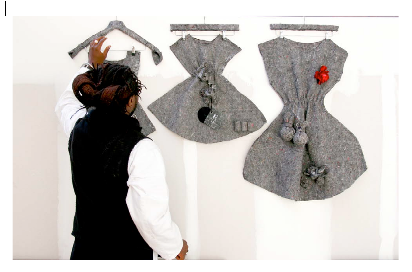
Details of the Matrouschkas dresses