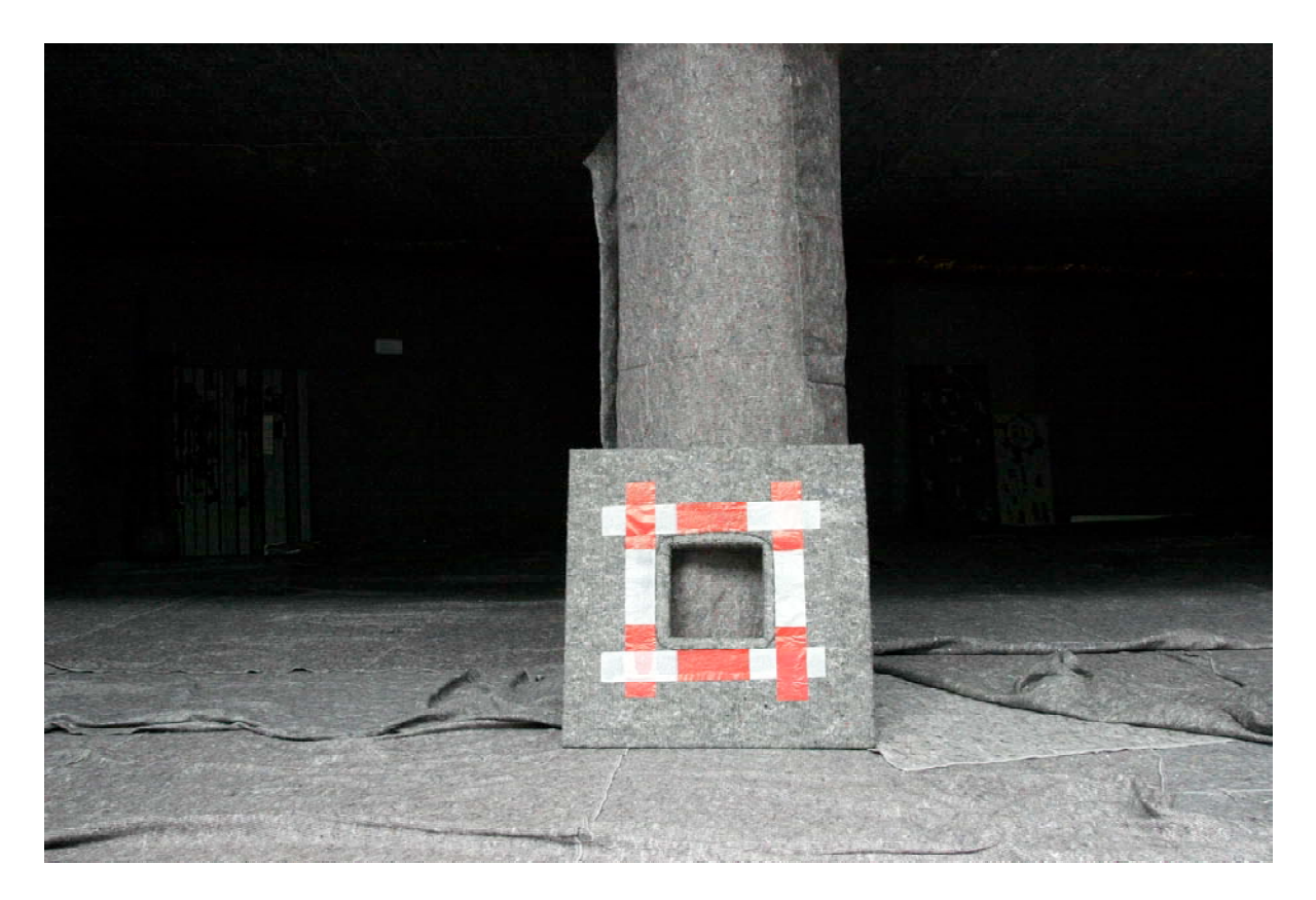
Load & Unloading Zone 2009 documentation of exhibition