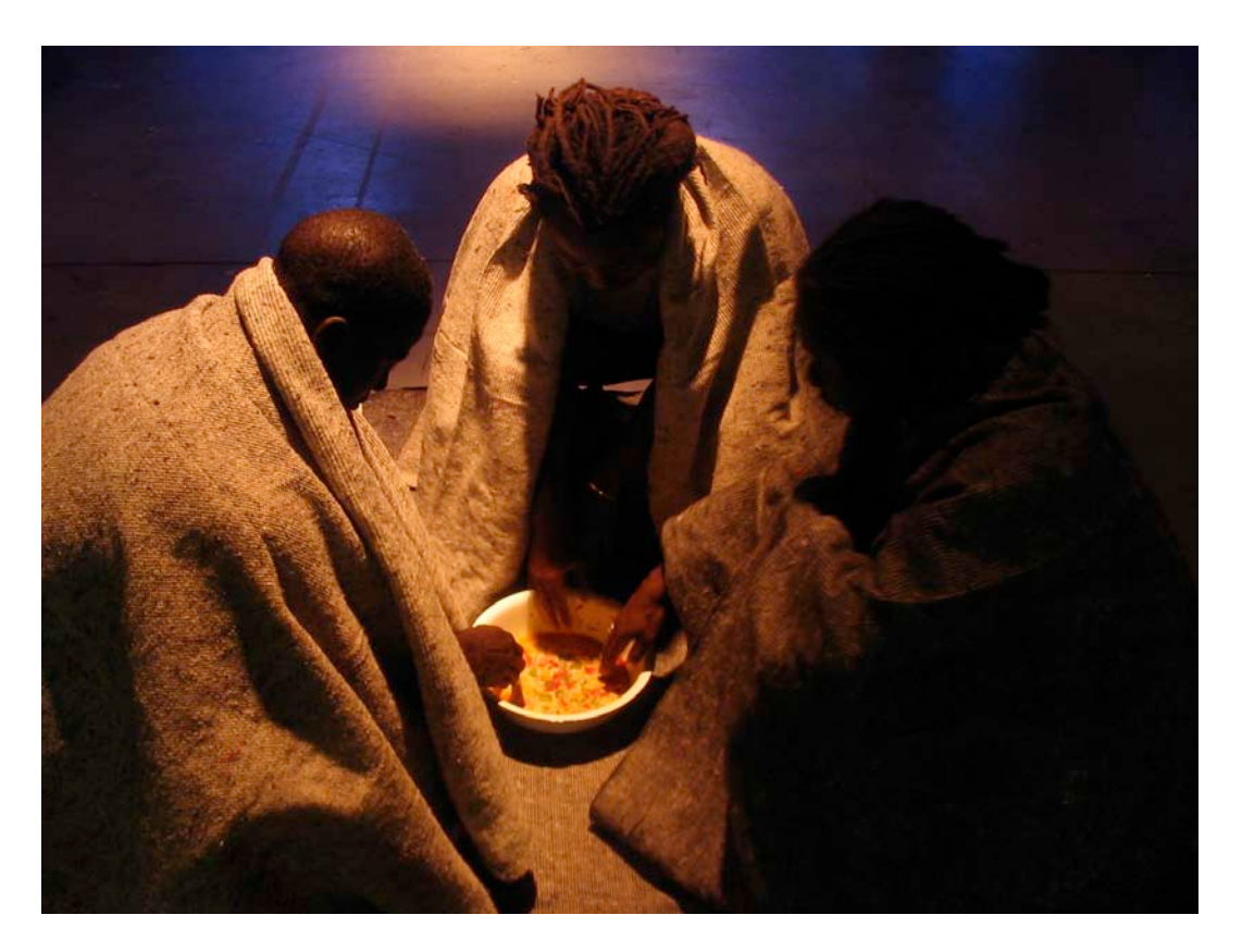
Without border documentation of live performance Installation