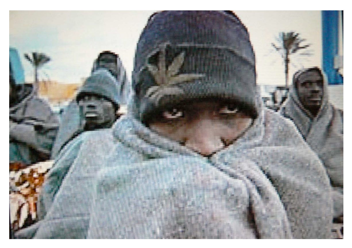
Found media image of illegal immigrant rescued at the Spanish coast.