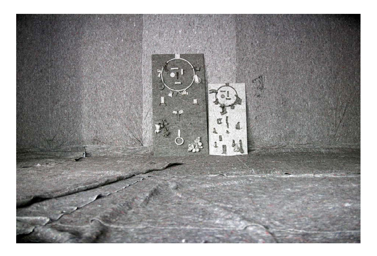
Details of the installation 2009 documentation of exhibition 2009