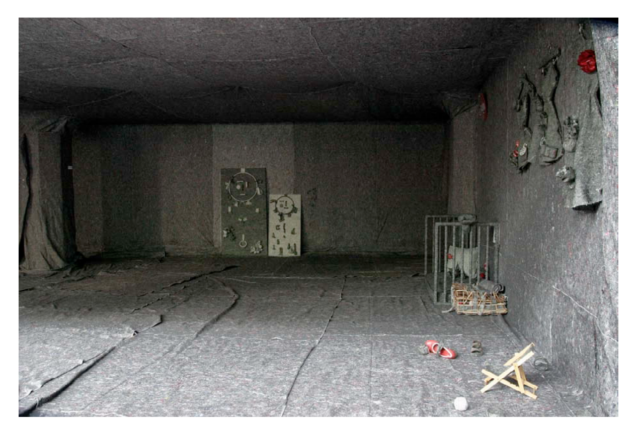
overview & atmosphere of the installation 2009