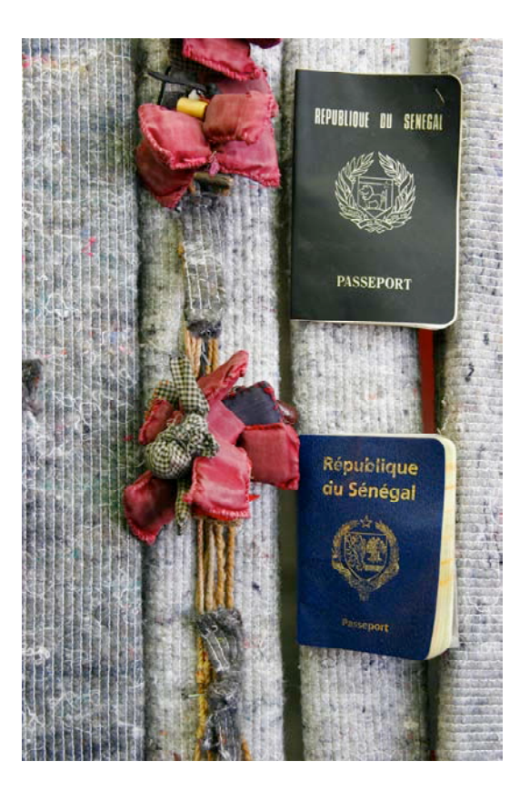
Installation gris-gris overview & details 2009