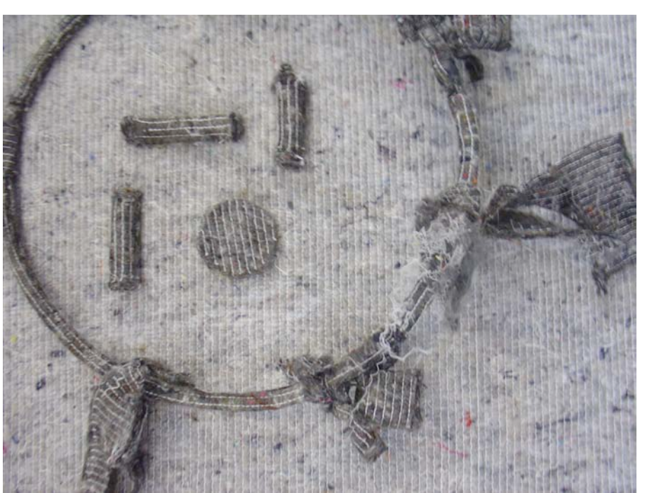
Smiling faces 2007 Two dimensional figure 110cm/70c