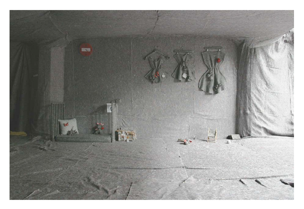
The artist's Daughter nursery 2008 documentation of exhibition