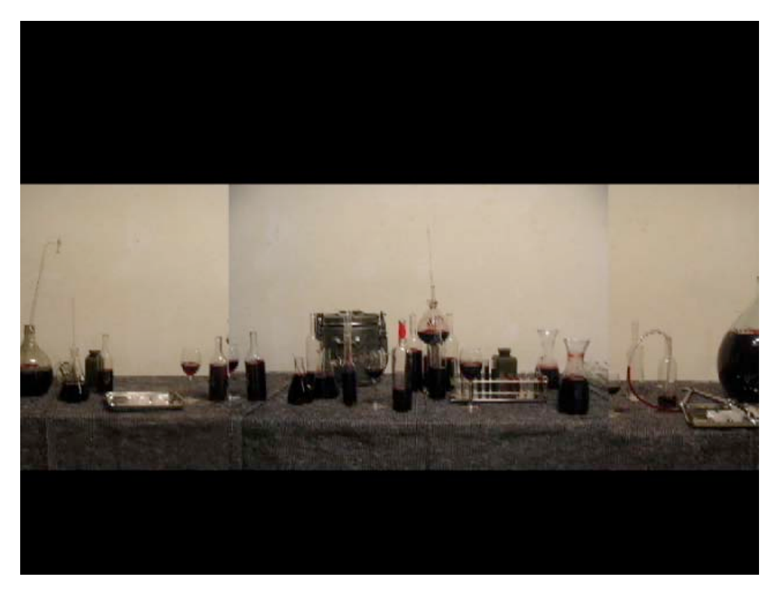
Experimental medium 2006 documentation of installation(laboratory)