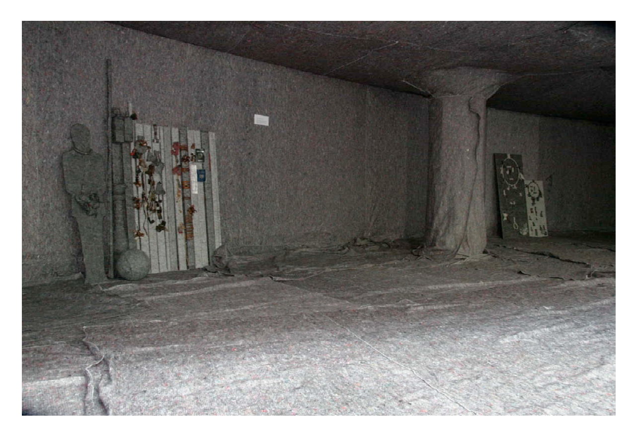
overview & atmosphere of the installation 2009