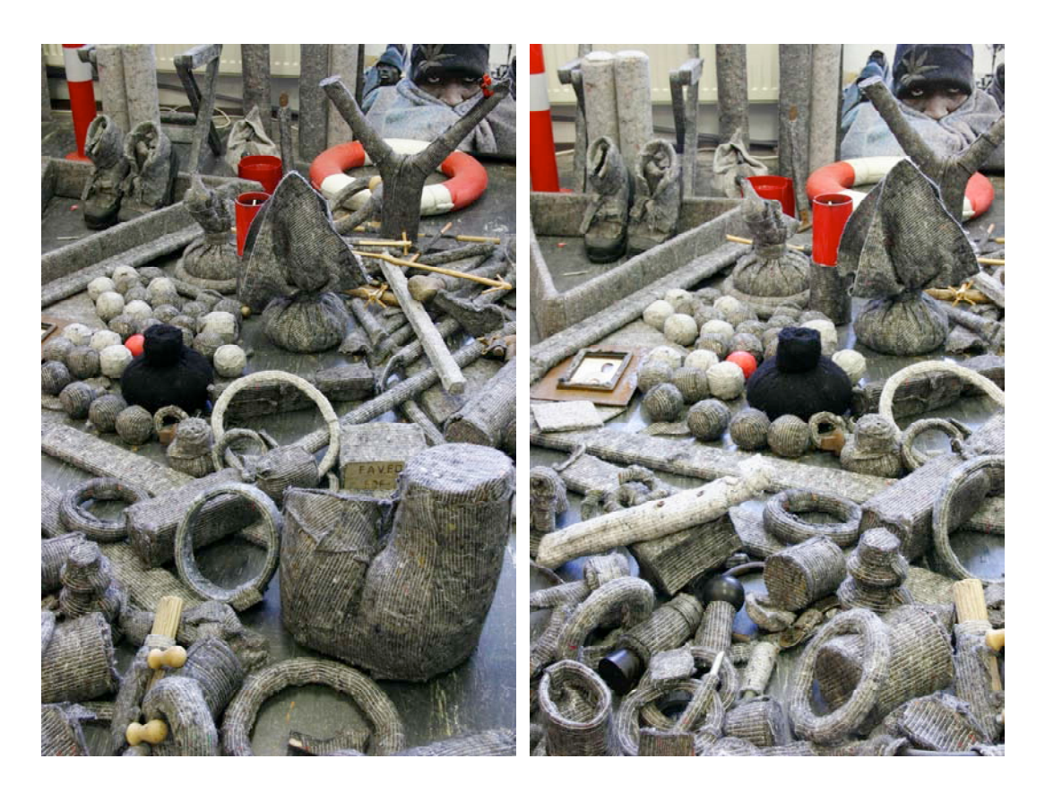
Load & Unloading documentation of exhibition 2009 (lots & found items)