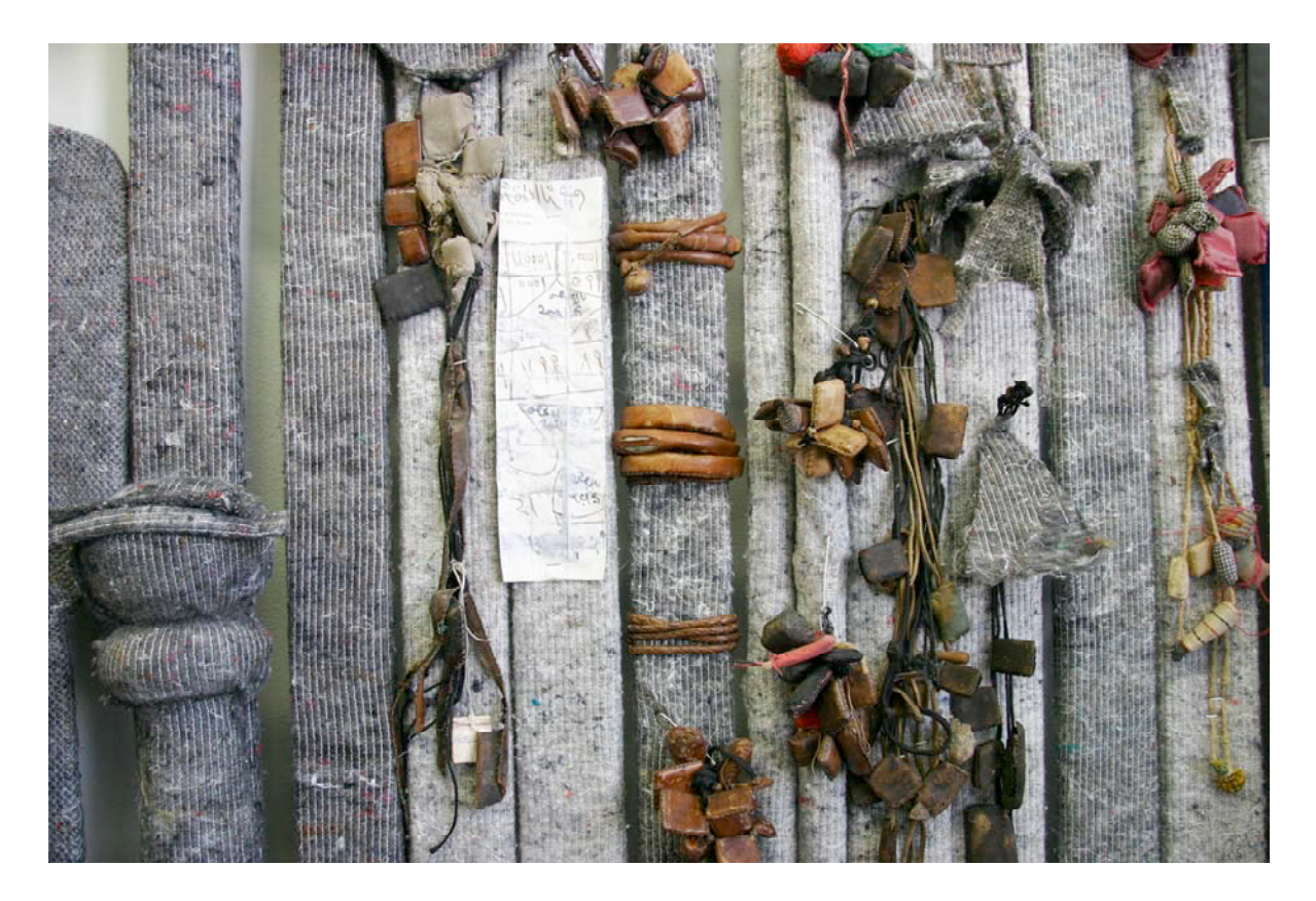
Details of the installation 2009 documentation of exhibition 2009