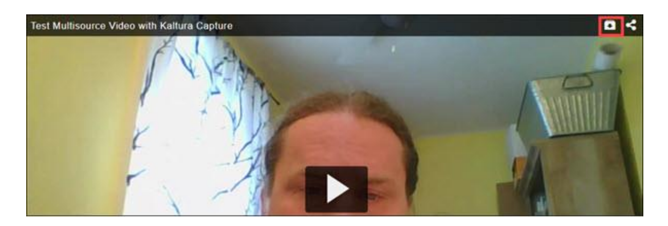
11a) The selected source file will now download to your local machine. Open the file and play it locally to verify that it is the file you want.